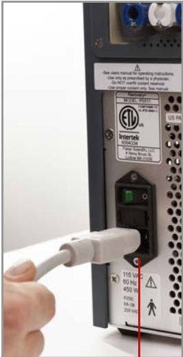
STEP 1 Plug in power cord