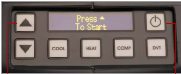
STEP 4 Press button to start therapy.