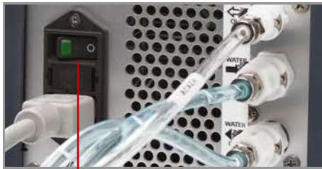
STEP 2 *Flip the switch off at the back of the machine. *Important: Do not switch off in the back before turning off the front of the unit