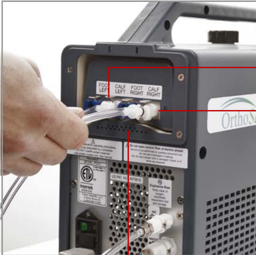
STEP 3 Connect DVT wraps to D CALF LEFT and E CALF RIGHT