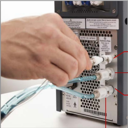
STEP 2 Connect umbilical hose lines to A COMPRESSION, B WATER IN and C WATER OUT