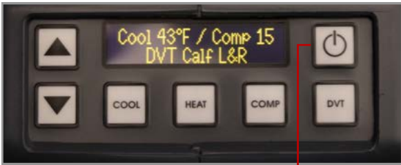
STEP 1 Hold button down until screen turns off .