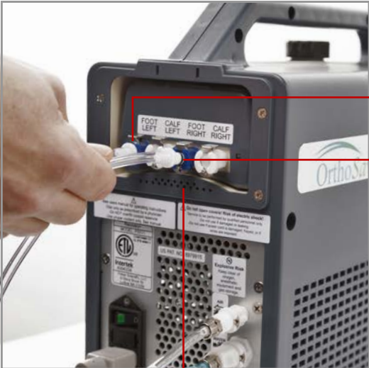
STEP 3 Connect DVT wraps to D FOOT LEFT and E FOOT RIGHT