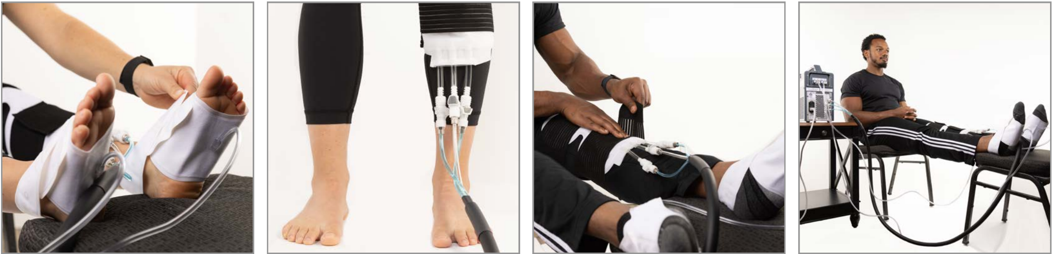
COMPLETED KNEE SET UP