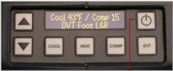
STEP 1 Hold button down until screen turns off .