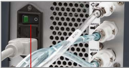
STEP 2 *Flip the switch off at the back of the machine. *Important: Do not switch off in the back before turning off the front of the unit