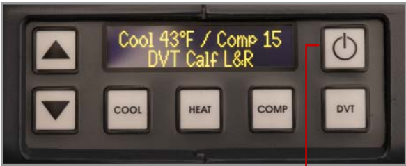
STEP 1 Hold button down until screen turns off .