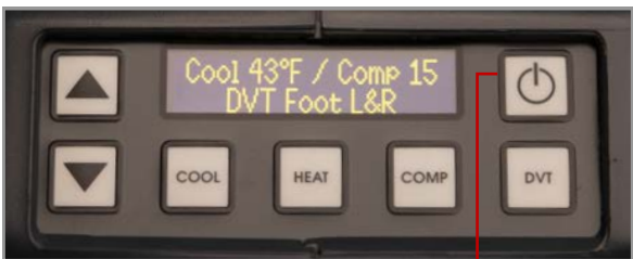
STEP 1 Hold button down until screen turns off .