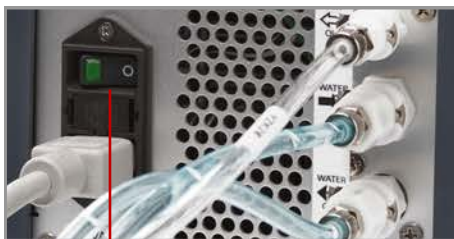
STEP 2 *Flip the switch off at the back of the machine. *Important: Do not switch off in the back before turning off the front of the unit