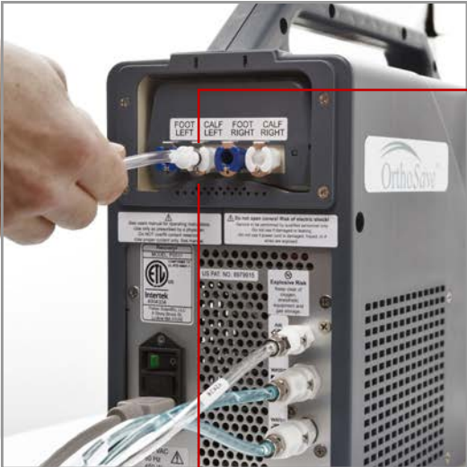
STEP 3 Connect a single DVT wrap to D CALF LEFT