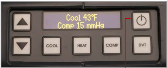
STEP 1 Hold button down until screen turns off .